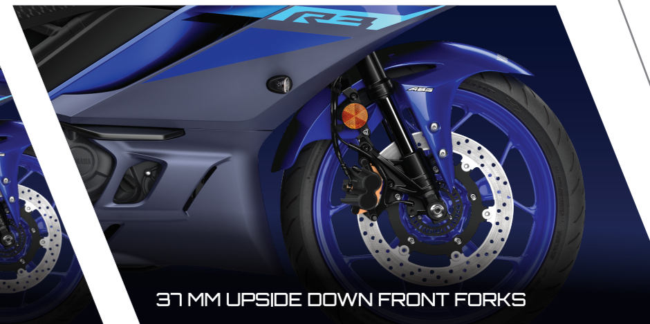
37 MM UPSIDE DOWN FRONT FORKS