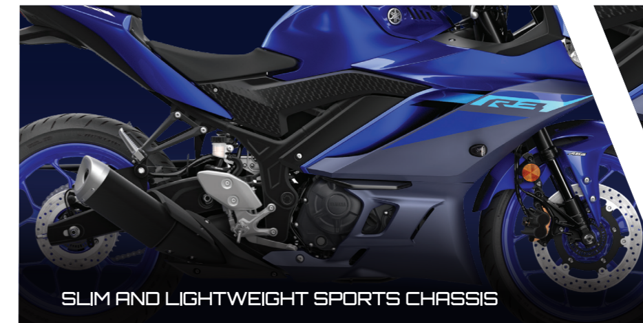
SLIM AND LIGHTWEIGHT SPORTS CHASSIS