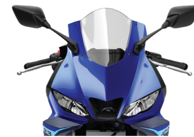
AGGRESSIVE R1-INSPIRED FACE