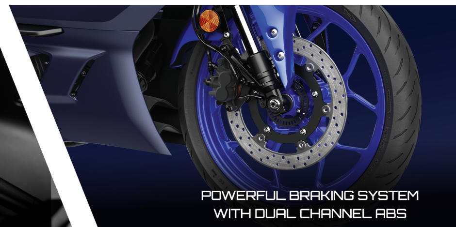
POWERFUL BRAKING SYSTEM WITH DUAL CHANNEL ABS