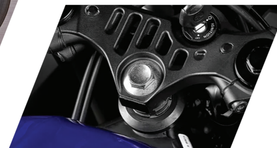
YZR-M1 INSPIRED CAST ALUMINIUM HANDLEBAR CROWN