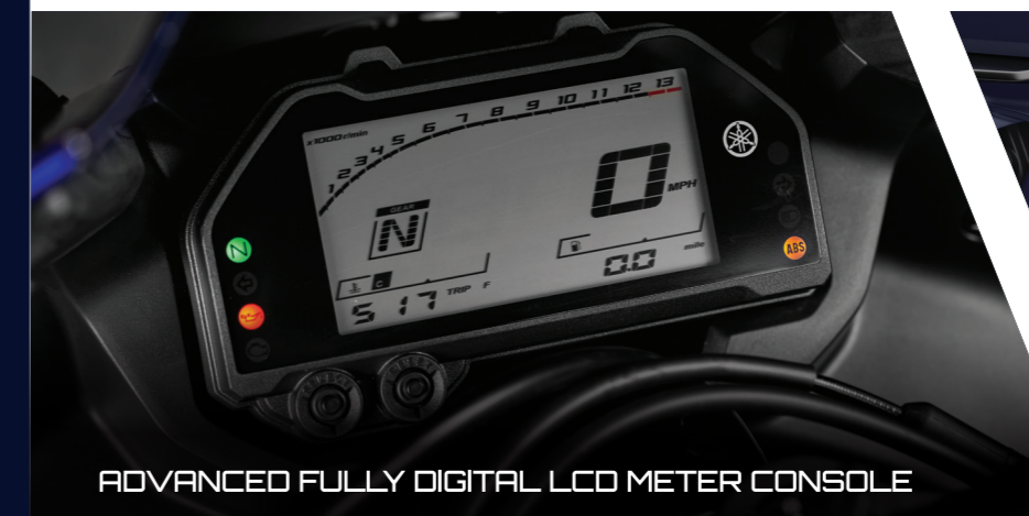
ADVANCED FULLY DIGITAL LCD METER CONSOLE