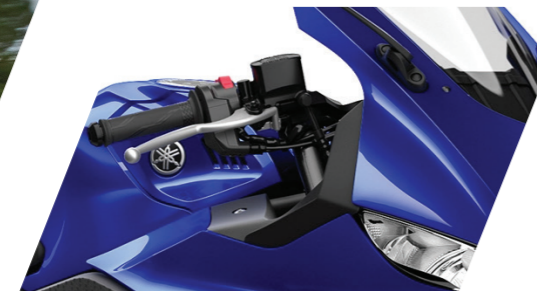
LOW FUEL TANK AND HANDLEBAR POSITION