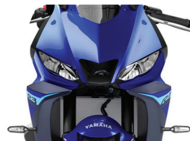
LED FLASHERS – FRONT & REAR