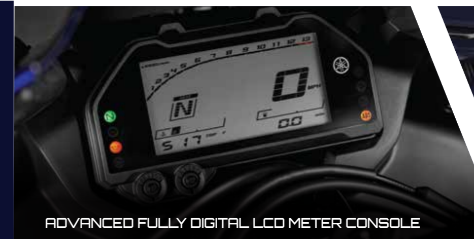
ADVANCED FULLY DIGITAL LCD METER CONSOLE