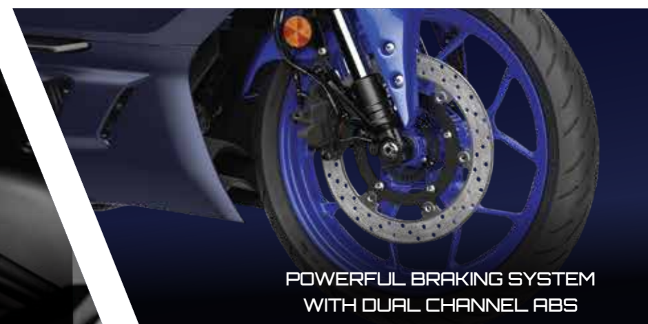
POWERFUL BRAKING SYSTEM WITH DUAL CHANNEL ABS