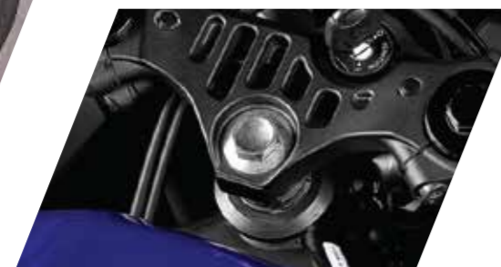
YZR-M1 INSPIRED CAST ALUMINIUM HANDLEBAR CROWN