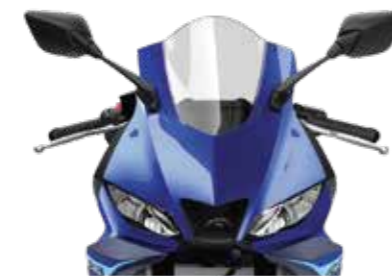
AGGRESSIVE R1-INSPIRED FACE