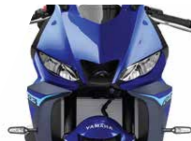
LED FLASHERS – FRONT & REAR