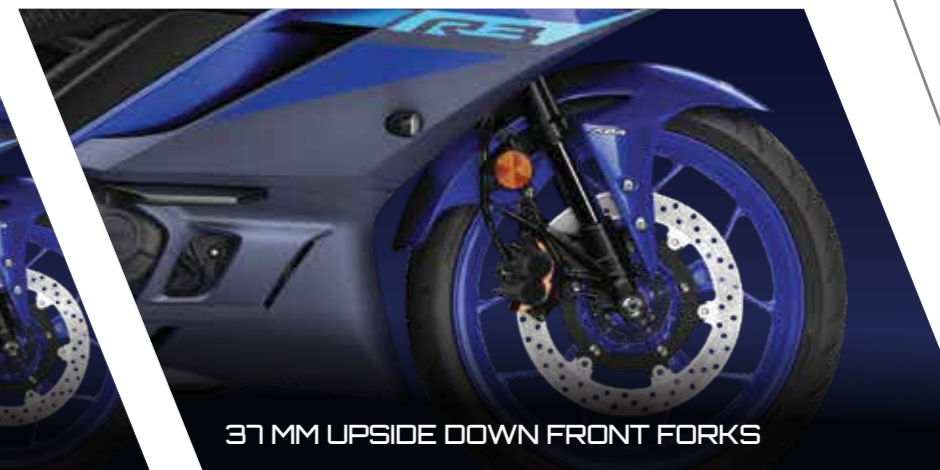
37 MM UPSIDE DOWN FRONT FORKS