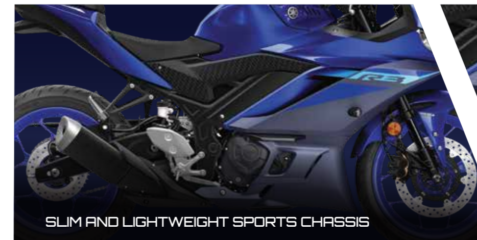
SLIM AND LIGHTWEIGHT SPORTS CHASSIS