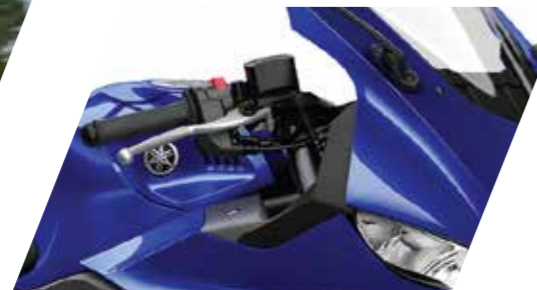
LOW FUEL TANK AND HANDLEBAR POSITION