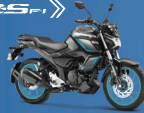
Cyan Metallic Grey