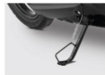
IN-BUILT SIDE STAND ENGINE CUT-OFF SWITCH