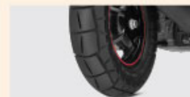
BLOCK PATTERN TYRE WITH SPORTY COLORED WHEEL STRIPES