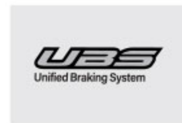
UNIFIED BRAKING SYSTEM