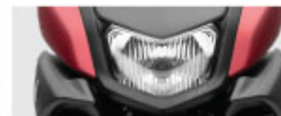
TOUGH LOOKING HEADLIGHT