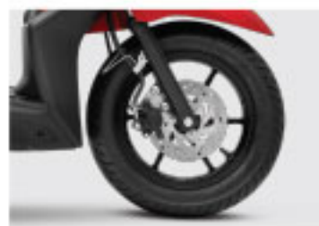
12inch CAST WHEEL (FRONT) WITH DISC BRAKE