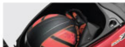
21L UNDER-SEAT STORAGE