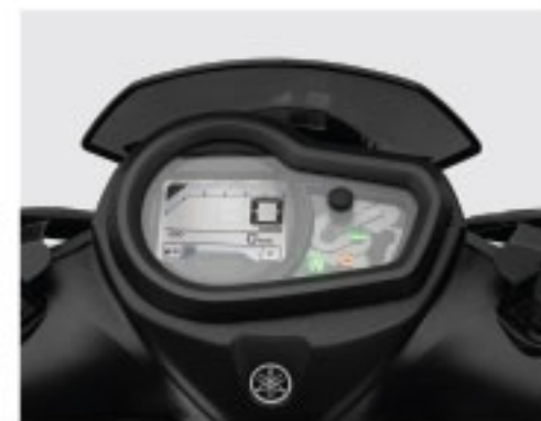
FULL DIGITAL INSTRUMENT CLUSTER*