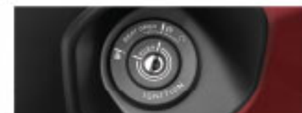
MULTI-FUNCTION KEY SWITCH