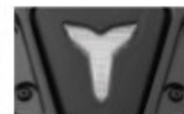
LED POSITION LIGHT