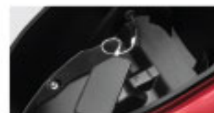
USB CHARGER (Optional)