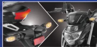
LED Flashers* & LED Tail Light*