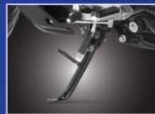
Side Stand Engine Cut-off Switch