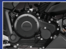
Durable 149cc Fuel Injection Engine