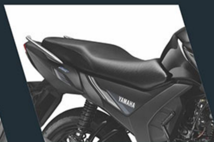
Wide Comfortable Seat & Split Grab Bar