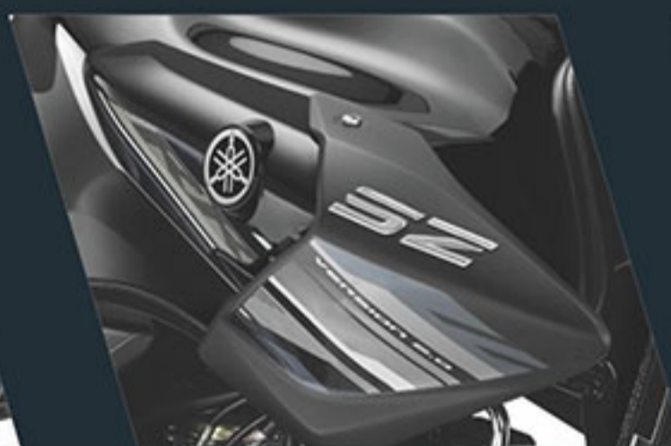
Stylish & Aggressive Graphics