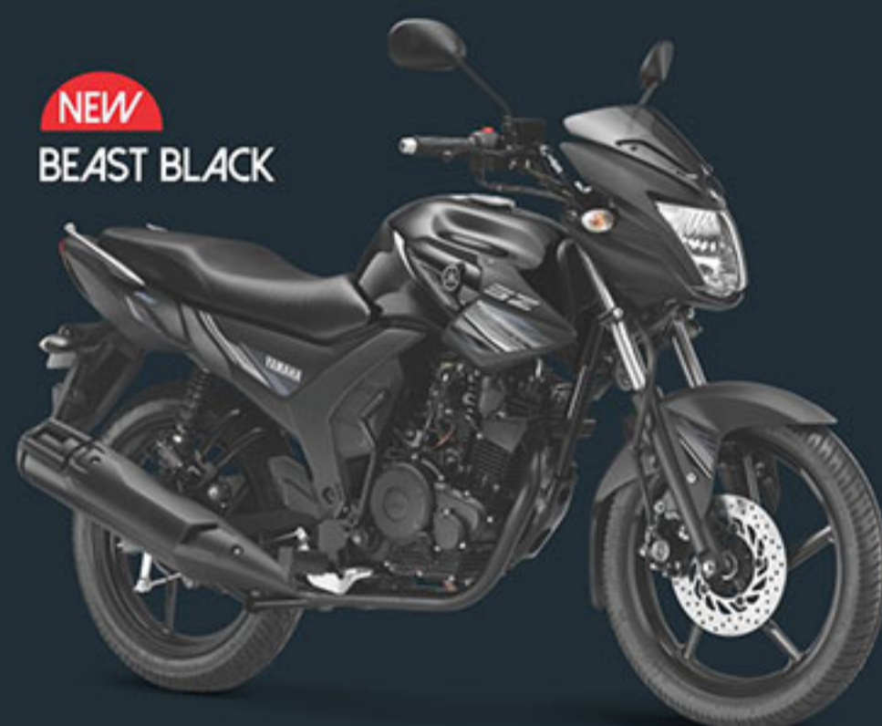
NEW BEAST BLACK