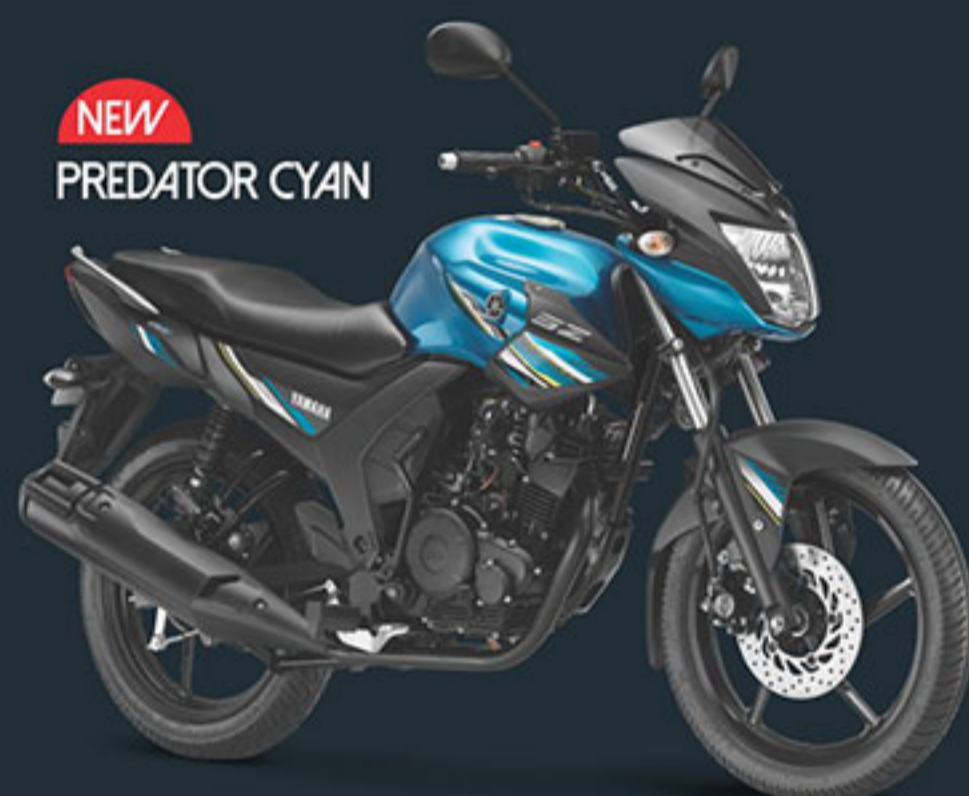
NEW PREDATOR CYAN