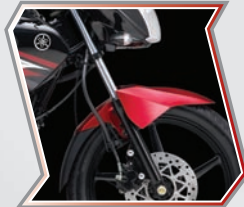
DU METAL FRONT FORK FOR SMOOTHER SHOCK ABSORPTION