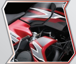
DYNAMIC SPORTY GRAPHICS