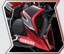
SPORT INSPIRED ENGINE COWL