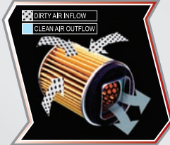
AIR FLOW FILTER FOR ENGINE EFFICIENCY