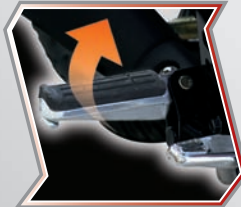
CONVENIENT RETRACTABLE FOOTREST